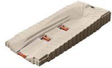
Available Tan or Gray